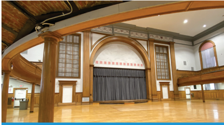
Edgerton Stardust Ballroom