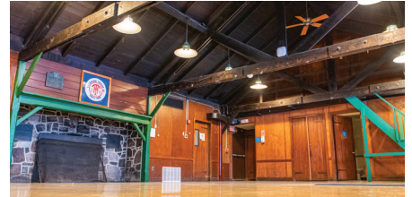
Tay House at Cobbs Hill Park

You can rent our facilities for private use—parties, birthdays, reunions and more! The Department of Recreation and Human Services also processes rentals of parks, baseball diamonds, athletic fields, tennis courts, indoor/outdoor basketball courts, ice skating rinks, pools, R-Center facilities and snow shoes.