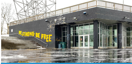
Dr. Martin Luther King Jr. Park, MLK Lodge