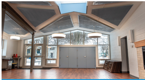
Genesee Valley Field House