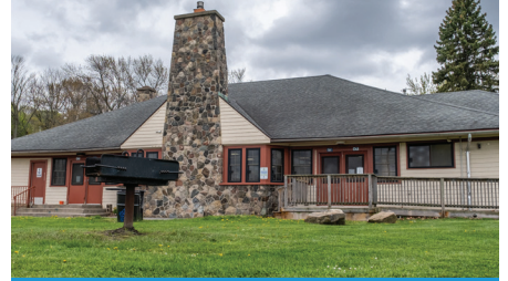
Lake Riley Lodge